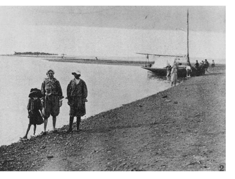
Below: An Australian family in standard togs for the time (1906)

Below: Two women in what would have been quite scandalous togs for the time (1910)